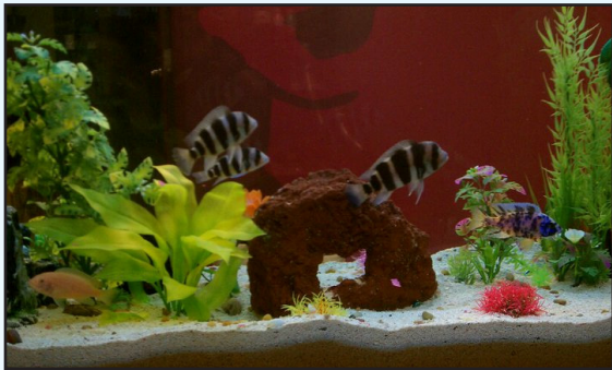
Francie just completed a small remodel of her salon by building her aquarium into the wall rather than a free standing one.