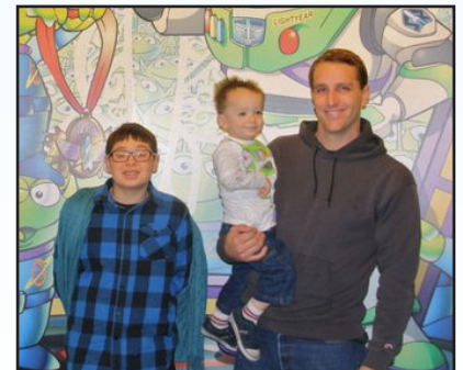
Look who got to go to Disneyland!