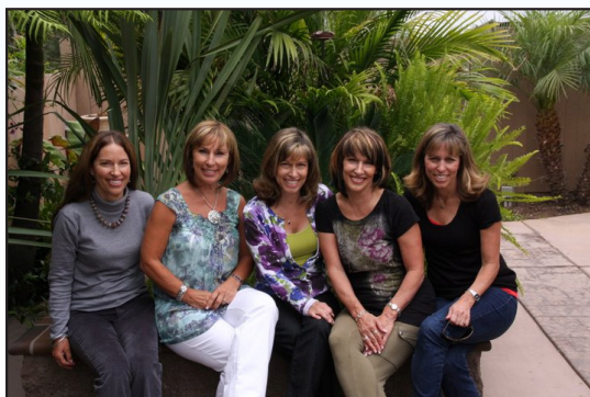
Who needs the Three Amigos when you can have the Cinco Hermanas?